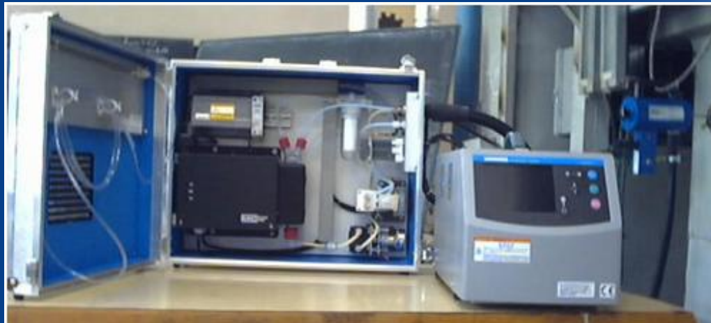
Automatic portable analyzer PG 250 - Horiba

Physical and Chemical Testing Laboratory from Romanian Institute for Gas Turbines-COMOTI is equipped with latest equipment to monitor emissions, temperature and speed of exhaust gases from source: