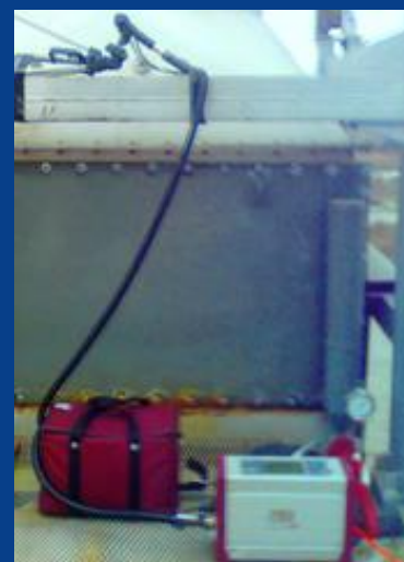
MRU - Vario Plus