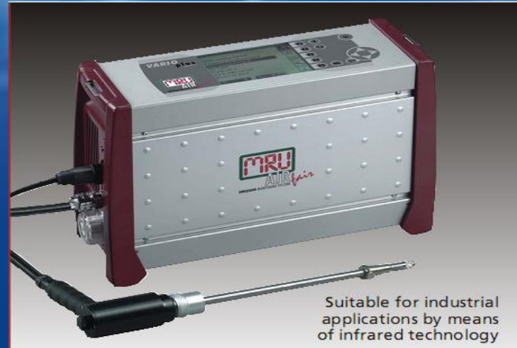
Automatic portable analyzer Vario Plus - MRU

Suitable for industrial applications by means of infrared technology