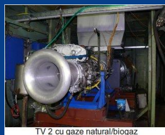
TV 2 cu gaze natural/biogaz

Testing gas concentrations (CO, CO 2 , NO x , SO 2 , O 2 ) of residual gaseous effluents (emissions) (RENAR Accredited Method)