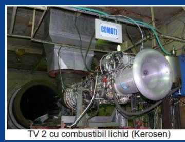
TV 2 cu combustibil lichid (Kerosen)